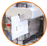
Labeled bag is automatically sealed and ready for shipping