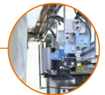
Multiple point scanning verification guarantees accuracy