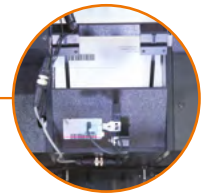
Patient information inserts are automatically printed, indexed, verified, folded and inserted with the integrated Continuous Print System