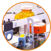
Initial scan inducts the order