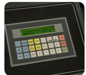
Color Coded Touch Screen