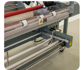
EZ Load Film Unwind