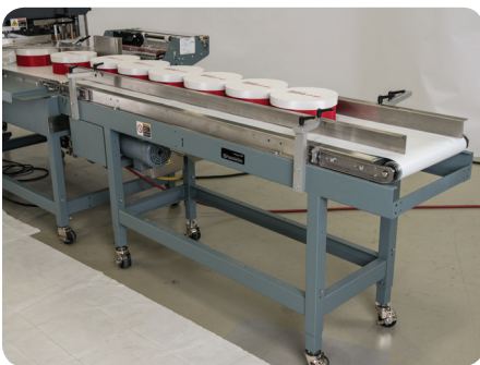
72" Product Separating Infeed