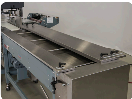
Adjustable Flight Bar Infeed