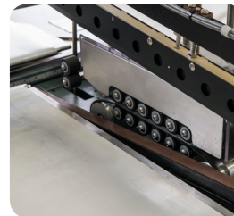
Automatic Film Puller