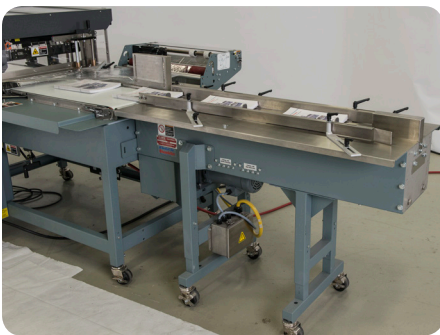
Adjustable Flight Lug Infeed