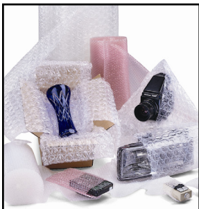
Bubble Wrap® & AirCap® Air Cellular Cushioning

Sealed Air's industry-leading investment in research and development and constant focus on World Class Manufacturing principles allow us to continue to deliver innovative packaging solutions that add measurable value to our customers' businesses around the world.