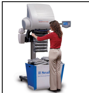
SpeedyPacker® Foam Packaging System