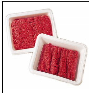
Cryovac® Case Ready Packaging Systems