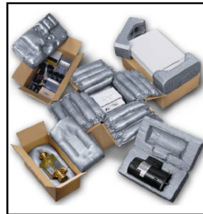
Instapak® Foam Packaging