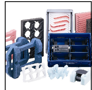
CelluPlank® Polyolefin Foam Stratocell® Laminated Foam