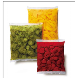
Cryovac® Flexible Pouch Systems