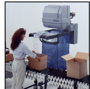
Fill Air™ Inflatable Packaging and Systems