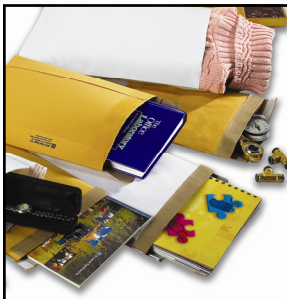
Jiffy Mailer® Products